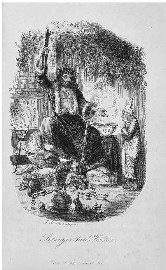
Figure 2 Scrooge meets the Ghost of Christmas Present, and learns how his decisions negatively impact others.

responding to patient wishes in a variety of contexts, which is explicitly against the original spirit of the methodology. 11 Despite considerable promise, the pursuit of patient-centred medicine faces special challenges stemming from the cross-disciplinary nature of decision-making. Unfortunately, these challenges have thus far remained underexplored. 12 While EBM greatly improved the quality of care and extended life expectancy of the global population over the course of the 20th century, much can still be done to improve the quality of healthcare by making it more patient centred as we continue our journey through the 21st century (figure 3). 11