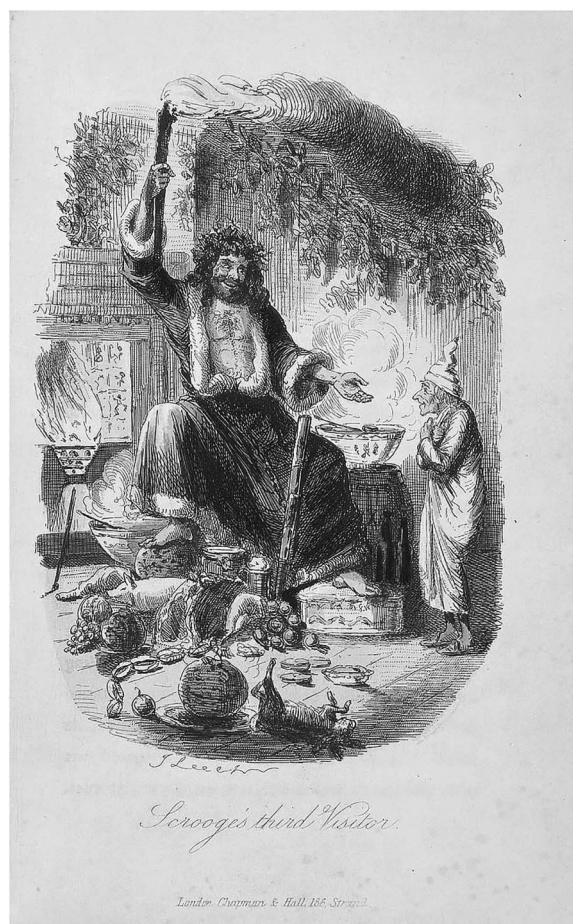
Figure 2 Scrooge meets the Ghost of Christmas Present, and learns how his decisions negatively impact others.

responding to patient wishes in a variety of contexts, which is explicitly against the original spirit of the methodology. 11 Despite considerable promise, the pursuit of patient-centred medicine faces special challenges stemming from the cross-disciplinary nature of decision-making. Unfortunately, these challenges have thus far remained underexplored. 12 While EBM greatly improved the quality of care and extended life expectancy of the global population over the course of the 20th century, much can still be done to improve the quality of healthcare by making it more patient centred as we continue our journey through the 21st century (figure 3). 11