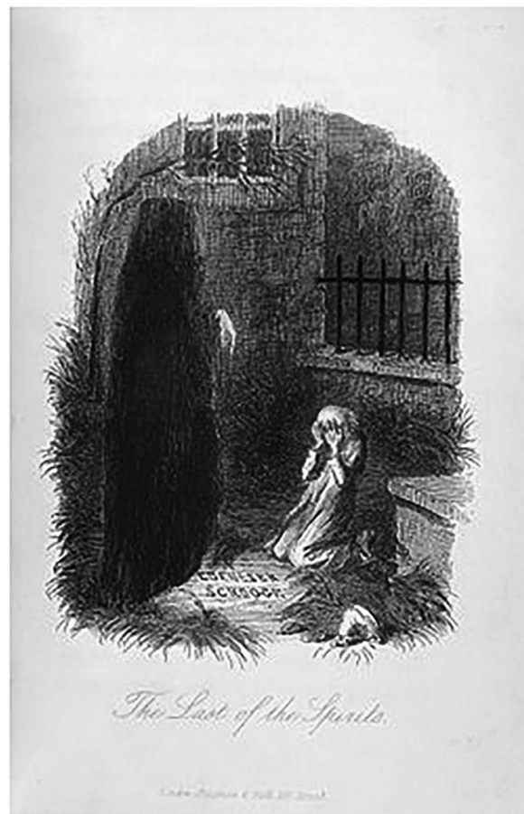
Figure 3 Scrooge meets the Ghost of Christmas Future, and learns of his fate as a tormented lost soul if he chooses not to become a better and more caring man.

systems, to assist in the visualisation of trade-offs inherent in the decision-making process, where appropriate. Such options and improvements to the existing architecture for medical decision-making would potentially help healthcare providers and patients make more informed decisions about a variety of clinical issues, especially when multiple treatment options are available with various degrees of risks and benefits.